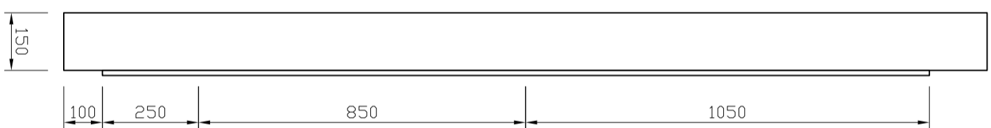
SIDE VIEW IPS FOR VANITYYS

SOLID SURFACING UNIT E4 SPENNELLS VALLEY ROAD KIDDERMINSTER DY10 1XS TEL : 01562 750000 FAX : 01562 750111 EMAIL : KUR.T@SOLIDSC.CO.UK